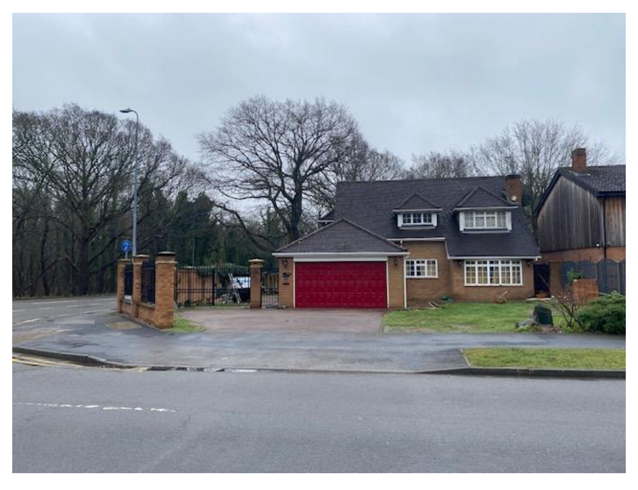
Update Sheet Further images received from Brian Harding for 1 Shearwater Road